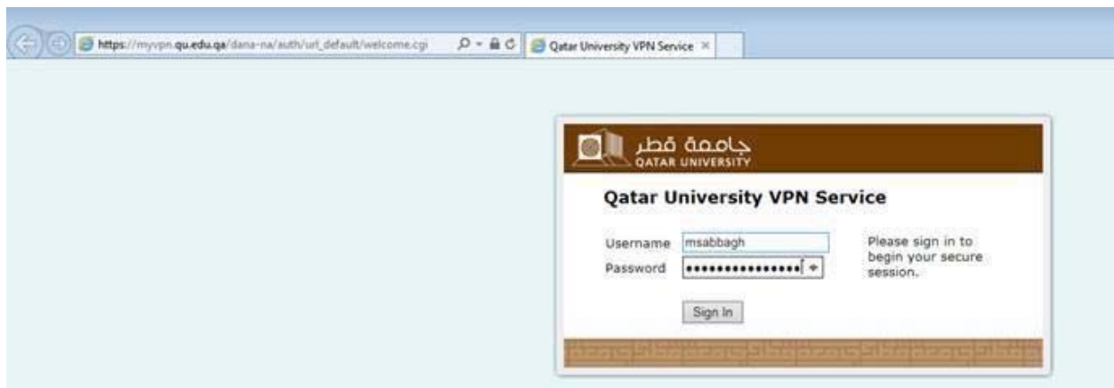
Figure 2: QU credentials