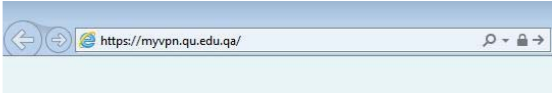
Figure 1: VPN's URL