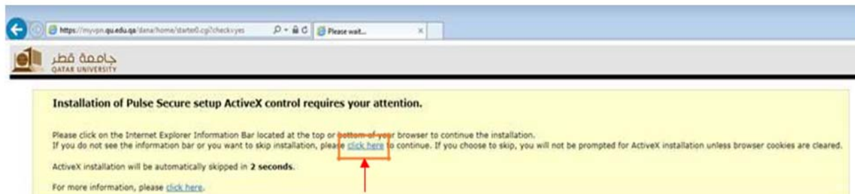
Figure 3: pulse secure access